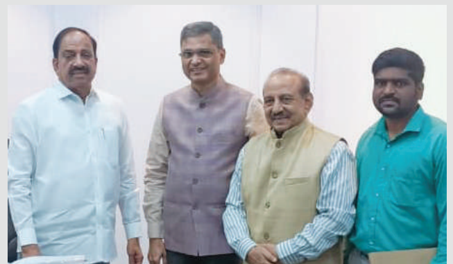
Sri Thummala Nageswara Rao , Hon'ble Minister for Agriculture, Marketing, Co-operation, and Handlooms & Textile, Government of Telangana : 10 th March, 2026