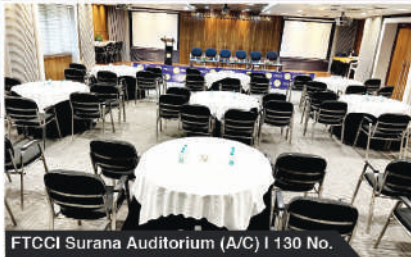
FTCCI Surana Auditorium (A/C) | 130 No.