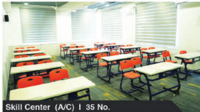
Skill Center (A/C) | 35 No.