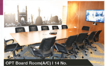
OPT Board Room(A/C) | 14 No.