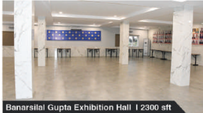
Banarsilal Gupta Exhibition Hall | 2300 sft