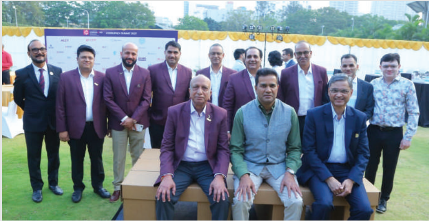
Unveiling the Next Era of Packaging : 18 th February, 2026, Hitex , Hyderabad