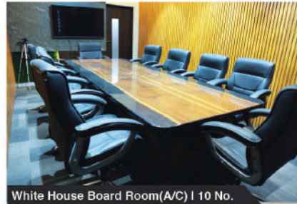
White House Board Room(A/C) | 10 No.