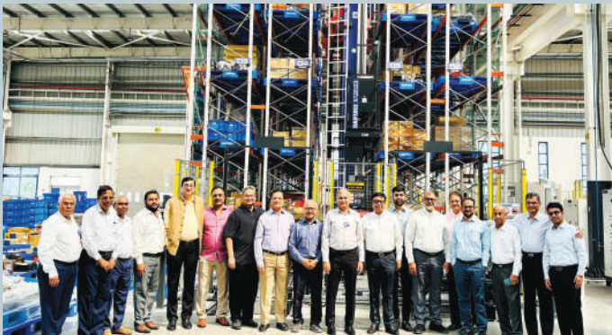
Daifuku Intralogistics India Pvt Ltd, Hyderabad