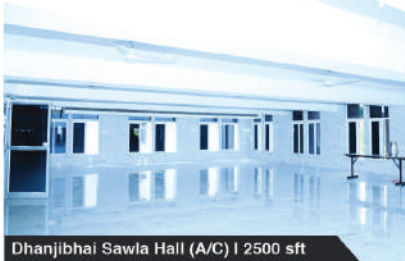
Dhanjibhai Sawla Hall (A/C) | 2500 sft