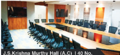
J.S.Krishna Murthy Hall (A.C) | 40 No.

For FTCCI Members 20% Discount on Hall Charges