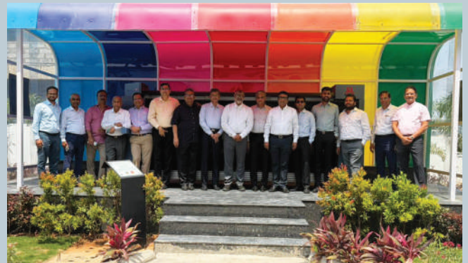
Macro Media Digital Lab, Hyderabad