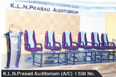
K.L.N.Prasad Auditorium (A/C) | 350 No.